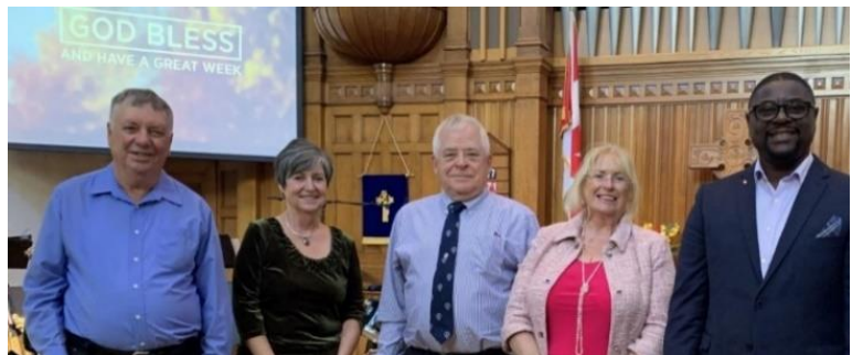
Recently ordained elders

“But among you it will be different. Whoever wants to be a leader among you must be your servant.” Matthew 20:26