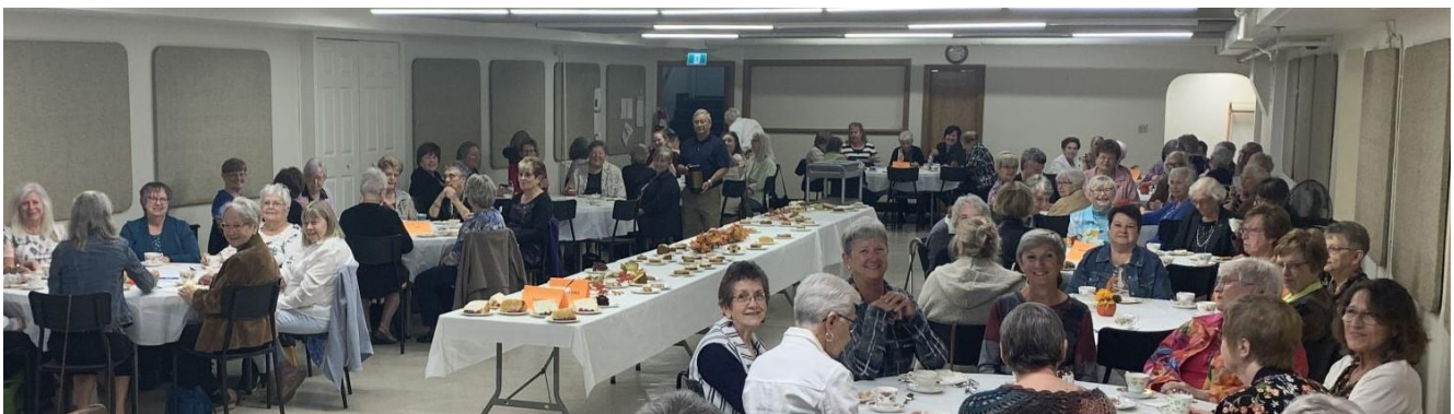
A Charity Fundraising Dinner in our Lower Hall

Behind the main sanctuary are our Meeting Hall, offices, Jean Thompson Lounge, and choir room. Our Sunday School is on the floor above and has been converted to a bright and spacious open concept “Children’s Garden”.