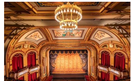
The restored interior of the Capitol Theatre, built in the 1930s.

FPC is located in the heart of Chatham, where the Thames River winds through the downtown core. Here you'll find cultural experiences like the Chatham Capitol Theatre to enjoy a play or concert, the Thames Art Gallery, where you can view contemporary and historical pieces, or enjoy some fun and entertainment.