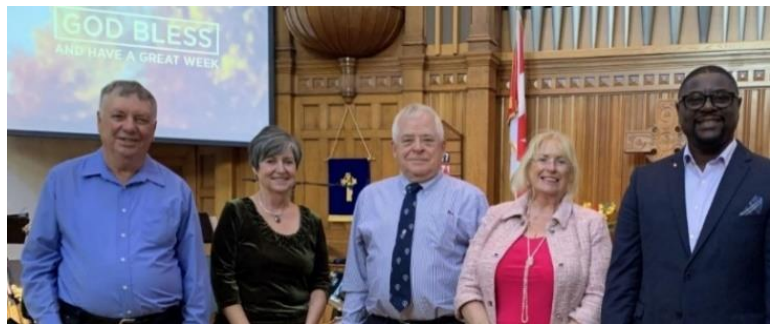
Recently ordained elders

“But among you it will be different. Whoever wants to be a leader among you must be your servant.” Matthew 20:26