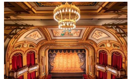
The restored interior of the Capitol Theatre, built in the 1930s.

FPC is located in the heart of Chatham, where the Thames River winds through the downtown core. Here you'll find cultural experiences like the Chatham Capitol Theatre to enjoy a play or concert, the Thames Art Gallery, where you can view contemporary and historical pieces, or enjoy some fun and entertainment.