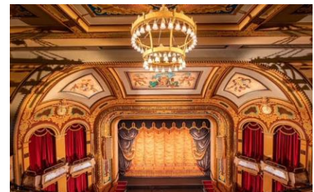
The restored interior of the Capitol Theatre, built in the 1930s.

FPC is located in the heart of Chatham, where the Thames River winds through the downtown core. Here you'll find cultural experiences like the Chatham Capitol Theatre to enjoy a play or concert, the Thames Art Gallery, where you can view contemporary and historical pieces, or enjoy some fun and entertainment.