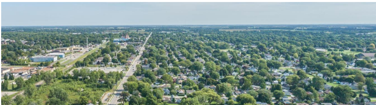
Chatham is surrounded by farmland and has a rich agricultural heritage. 4