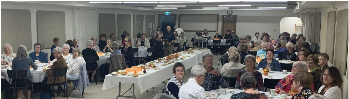
A Charity Fundraising Dinner in our Lower Hall

Behind the main sanctuary are our Meeting Hall, offices, Jean Thompson Lounge, and choir room. Our Sunday School is on the floor above and has been converted to a bright and spacious open concept "Children's Garden".