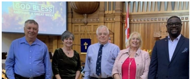
Recently ordained elders

“But among you it will be different. Whoever wants to be a leader among you must be your servant.” Matthew 20:26